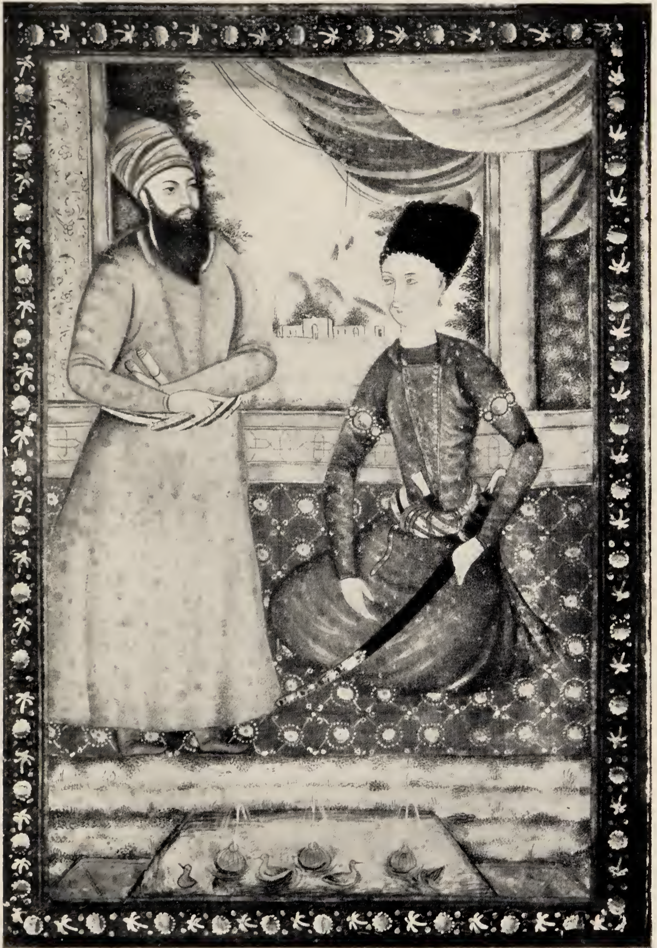
ÁQÁ MUḤAMMAD KHÁN QÁJÁR seated, with his minister ḤÁJJÍ IBRÁHÍM standing before him